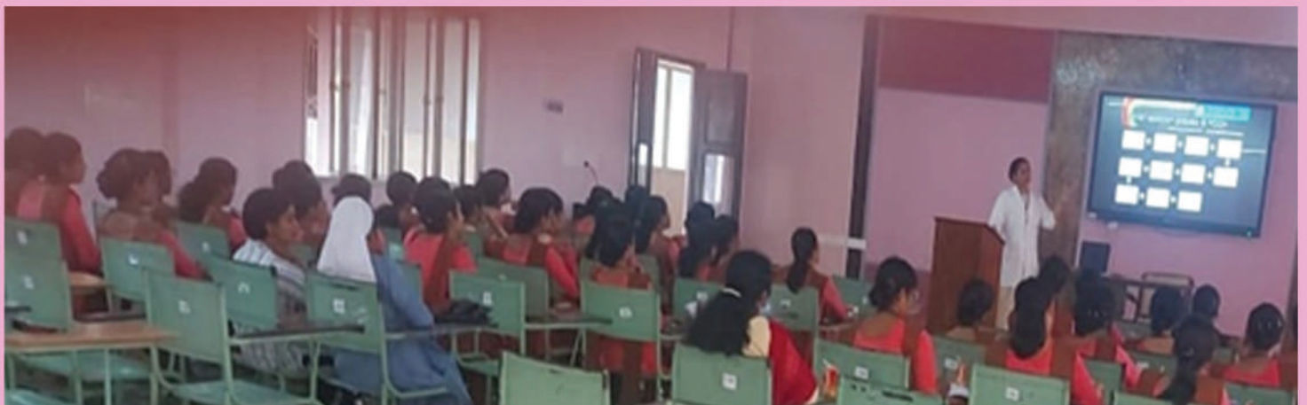
Holy Cross college of Nursing, Kottiyam students visited at Pushpagiri College of Nursing on 14 December, 2023, as part of their management of Nursing Service and Education requirement.