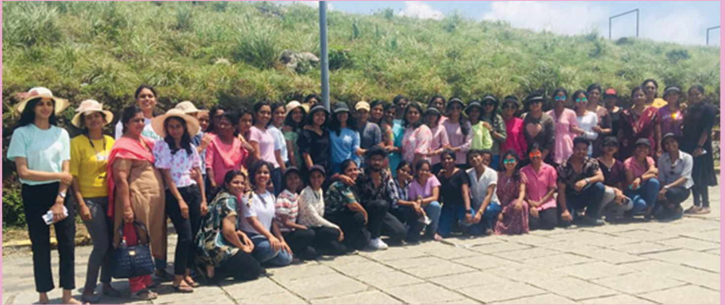
4 th semester (2021 batch) B.Sc Nursing students and teachers at Wagamon on 10 th October, 2023