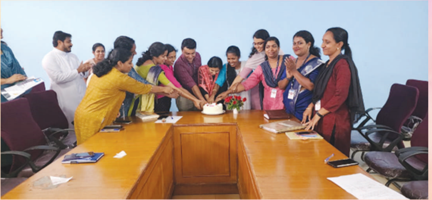
Birthday and wedding Anniversary celebration held on 26 th June, 2023 at the College conference room.