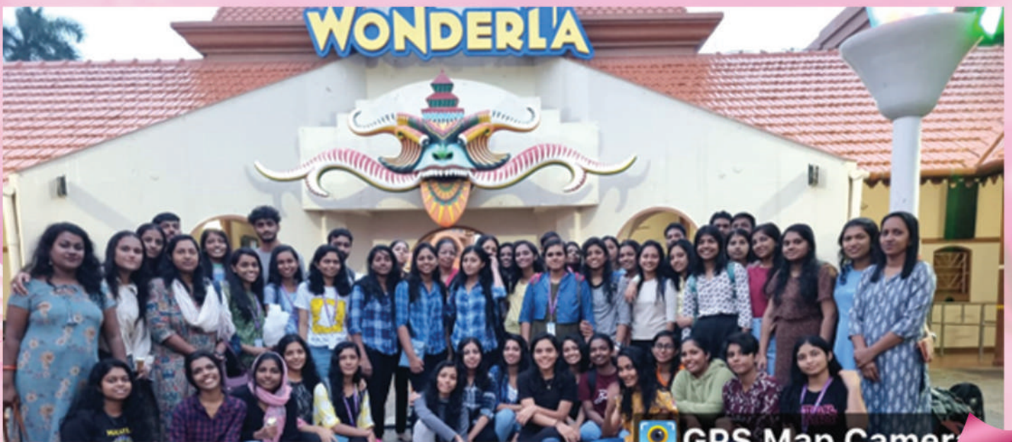
Second semester students and staff at Wonderla on 27 th June, 2023.