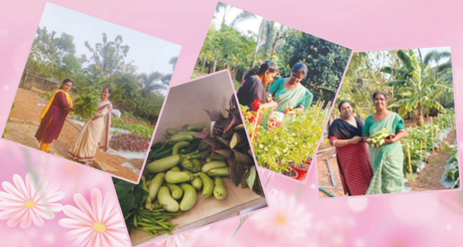
Agriculture harvesting and selling vegetables from the PCON garden.