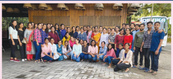
Fourth year BSc.(N) students and teachers