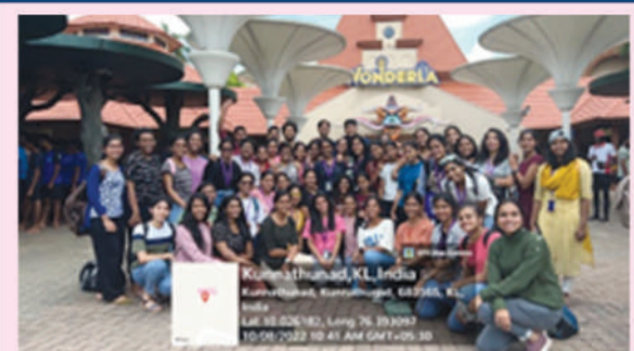
Third year B.Sc.(N) students & teachers