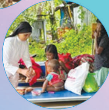
Medical camp on 04 November, 2022