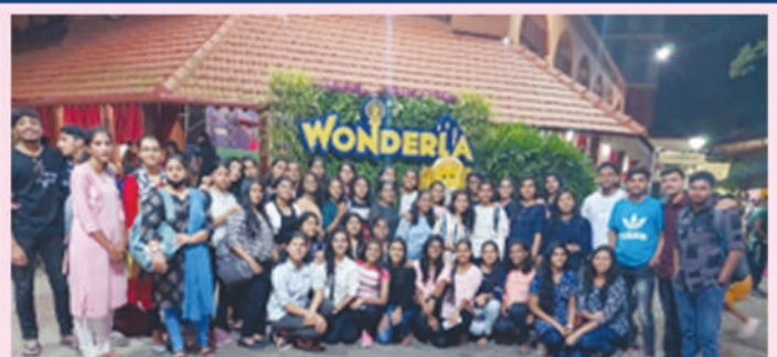
Second year B.Sc.(N) students and teachers