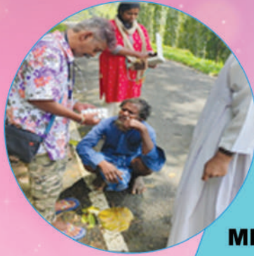
Camp on 7 th October, 2022